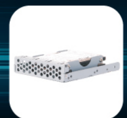
1 x Internal 3.5" bay for 3.5" or 2.5" HDD with SK41203