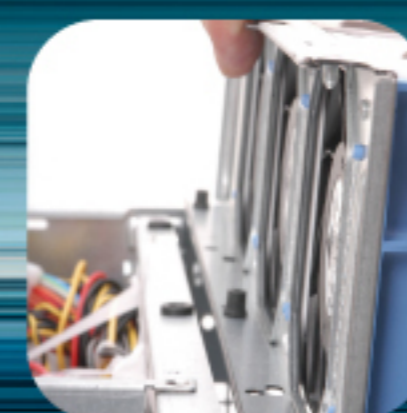
Fan bar with anti-vibration rubbers