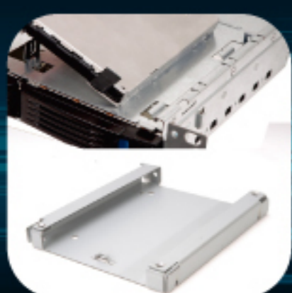
Screwless lock for slim FDD Or 2.5" HDD kit