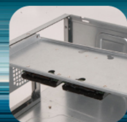
Optional bracket for 1 x internal 3.5" HDD or 2 x internal 2.5" bays