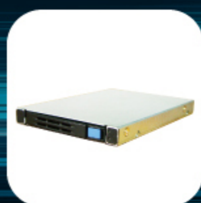
Slim FDD or 2.5" HDD with SK51101