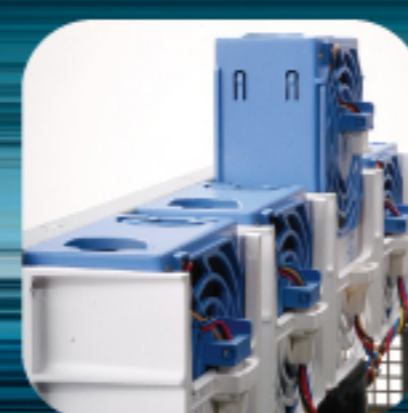
Screwless 4 x middle 80 mm hot-swap fans