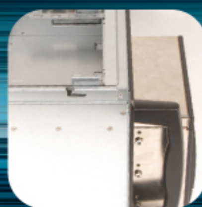
Screwless lock for 5.25" bays