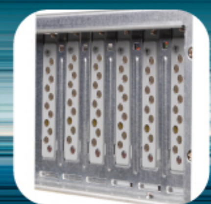
Changeable rear window for low profile