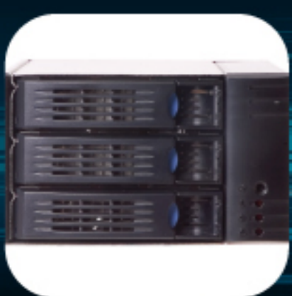
4 x 5.25" bays for ODD or storage kits