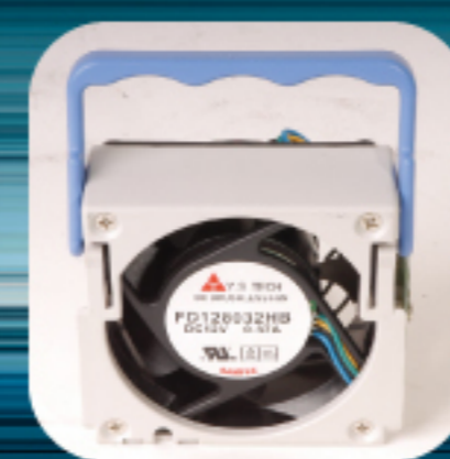
Optional screwless 4 x middle hot-swap fans