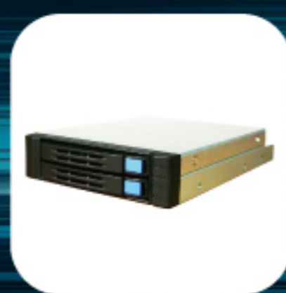
2 x 3.5" bays for FDD or 3.5"/2.5" HDD with storage kits