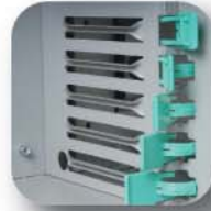
Screwless card retainer