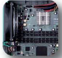
Mini-SAS module backplane