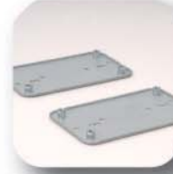
CPU mounting kits for 12" x 10.5" CEB M/B