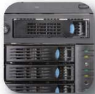
3 x 5.25" bays for ODD or storage kits