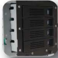
Renovable HDD cage for hot-swap or non hot-swap